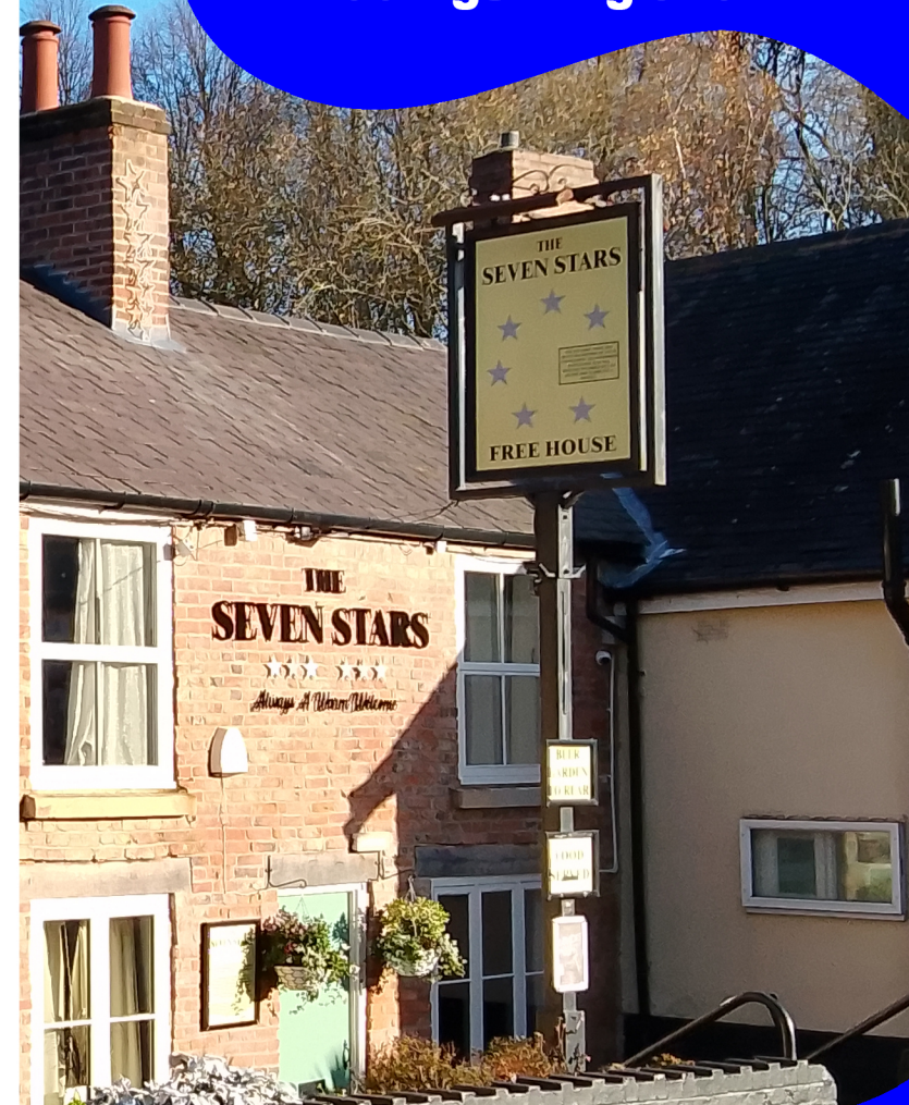
The Seven Stars