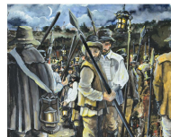
Taken from painting by Fiona Ibbotson