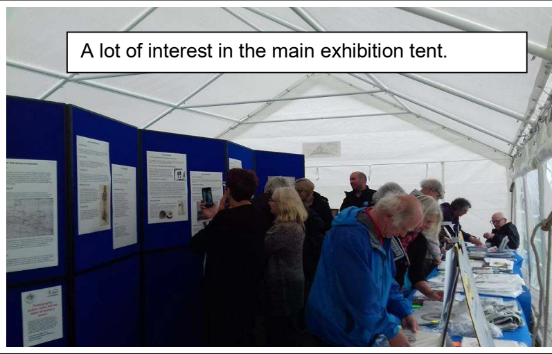
A lot of interest in the main exhibition tent.