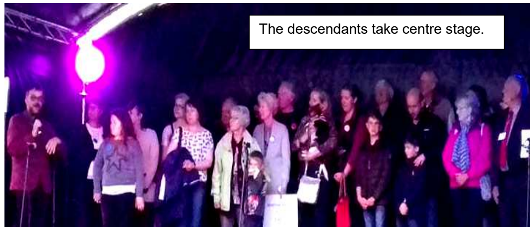
The descendants take centre stage.