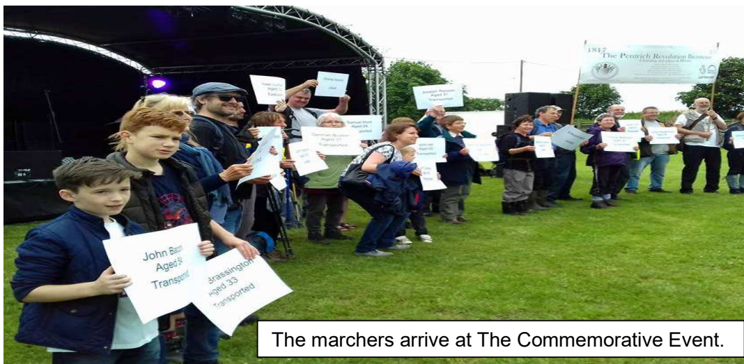
The marchers arrive at The Commemorative Event.